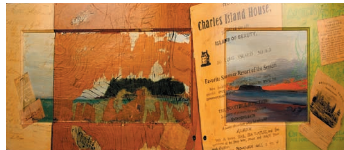
Ode to Charles Island

provides children with cancer and other life-threatening illnesses a camping experience—a place where a kid can find camaraderie, joy and a renewed sense of being a kid.